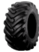
IND SG IMP