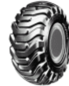
SGL DL 2A